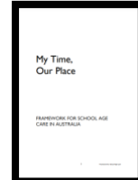
My Time, Our Place; Framework for School Age Care in Australia

Critical reflection: Reflective practices that focus on implications for equity and social justice ( Early Years Learning Framework – refer to Sources ).