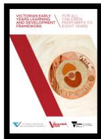
Victorian Early Years Learning and Development Framework

Approved learning framework: A document that outlines practices that educators and co-ordinators must use to support and promote children’s learning. The Early Years Learning Framework (Belonging, Being & Becoming) , the Victorian Early Years Learning and Development Framework and My Time, Our Place; Framework for School Age Care in Australia are approved learning frameworks for use in Victoria ( refer to Sources ).